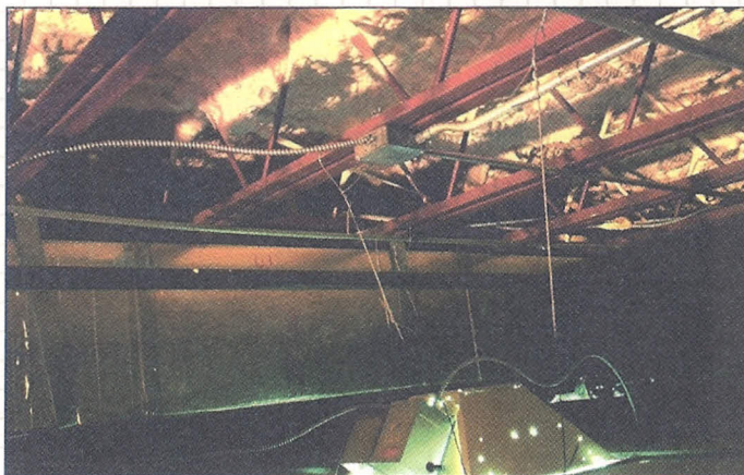
Icynene® insulation applied directly to the metal ceiling area below the chillers and walk-in freezers.

Sprayseal concluded that to prevent the formation of condensation on the metal ceiling deck, 3 inches of Icynene® would be applied directly to the affected area. One ceiling tile at a time was removed to provide access to the area between the dropped ceiling and the metal decking. Icynene® insulation was then applied directly to the metal decking, with the area below protected from over-spray by the remaining ceiling tiles. This spraying process was repeated until the entire area that had been producing condensation was covered.