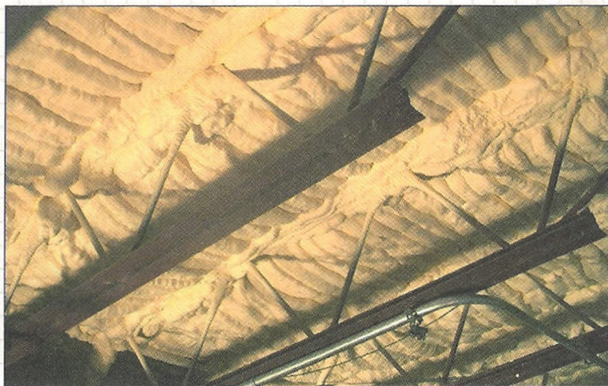
Area of application for Icynene® included the footprint of the chillers and walk-in freezers plus a perimeter area extending 10 feet beyond.