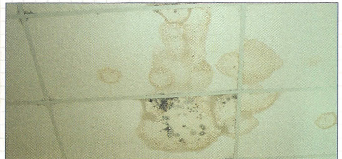
Discolored ceiling tiles were constantly being replaced by Boulineau's who pride themselves on a neat and clean retail environment.