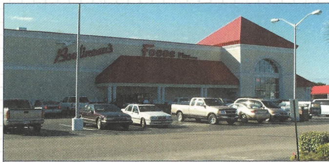
Boulineau's Grocery & Department store, Myrtle Beach, South Carolina.

Boulineau's is a quality grocery and department store located in the resort area of North Myrtle Beach, South Carolina. In this hot, humid climate, the design cooling temperature is 92 degrees and summertime relative humidity levels often reach 90% and higher.